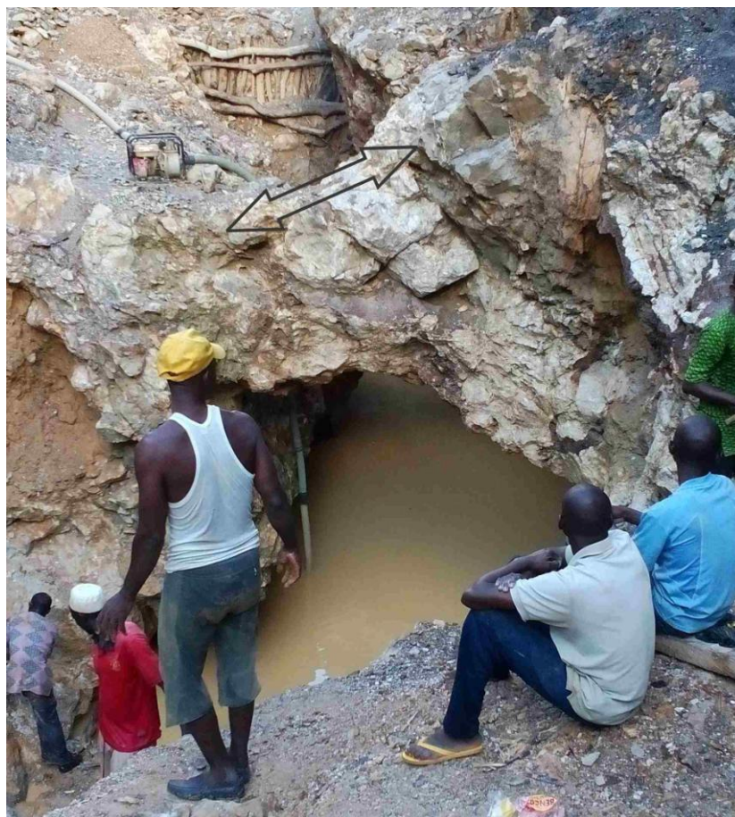
Fig 3. Azara Baryte Vein 17 (Note: Water level in pit and poor overpass which is already failing)