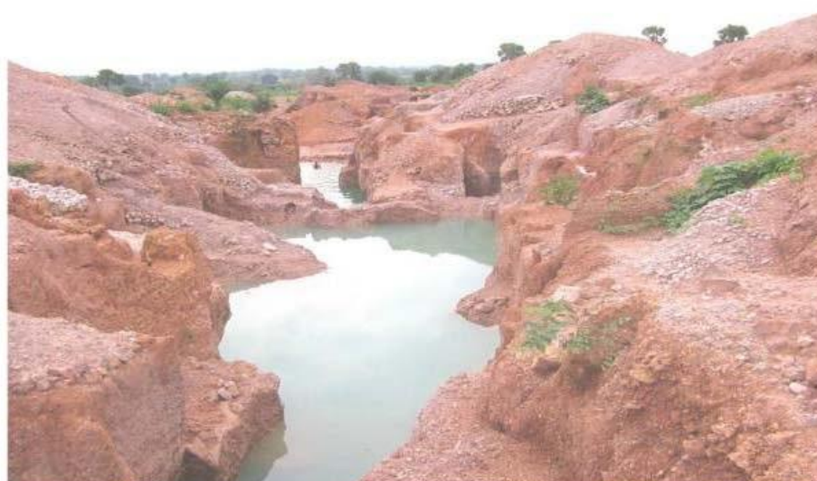
Fig 4. The Gabu Osina Baryte Vein in the Lower Benue Trough showing flooding peculiar to deposits across the trough (Oden, 2012)