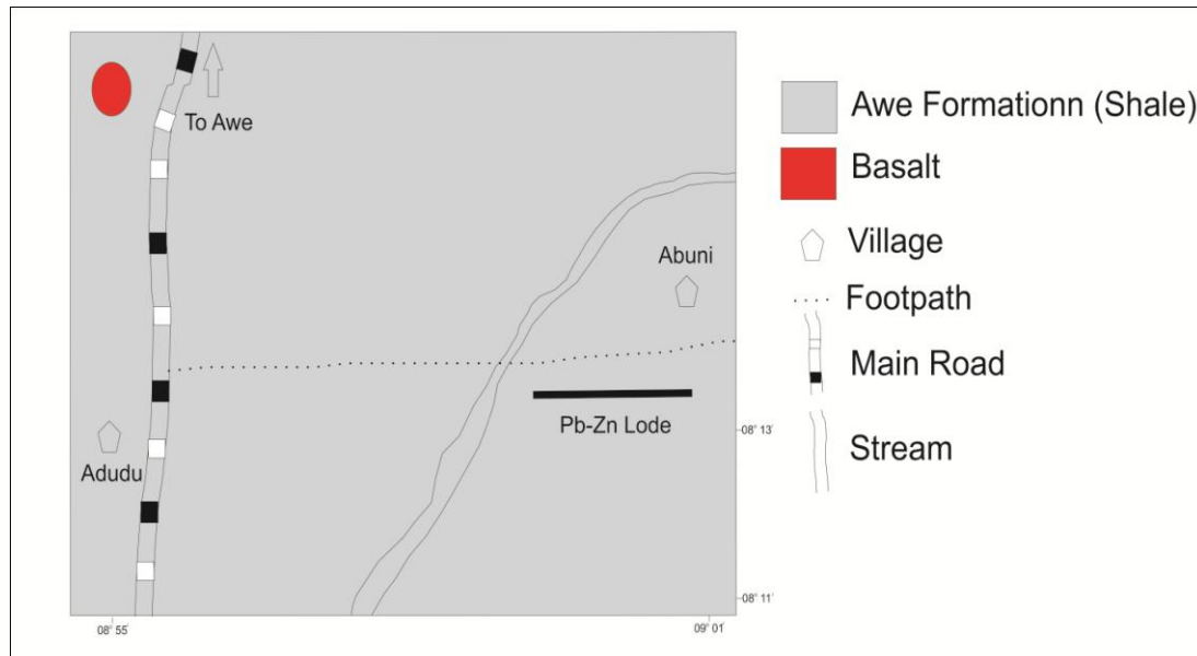
Fig 5. Geologic Map of the Adudu-Abuni Pb-Zn Deposit

Most of the mining here is semi-mechanized with a huge reliance on manual labour. To a certain extent better planned than the Azara mines, the Adudu-Abuni deposits also use a crude open strip method to mine the lead-zinc. Although some bench allowance is given for workers and some machinery to move in, it is so poorly designed that most of the benches fail due to improper support and overweight. Workers assisted by excavators and drilling equipment chip away and blast the compact shale to strip the lead-zinc. The tightly folded but fractured shales are water bearing with significant recharge coming from run-off water from higher ground into the mine pits.