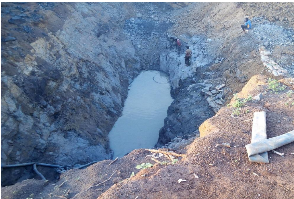
Fig 6. Mine pit after about 2 hour of pumping (Approximate depth to pit base from present water surface is 3m)

Most of the mining here is semi-mechanized with a huge reliance on manual labour. To a certain extent better planned than the Azara mines, the Adudu-Abuni deposits also use a crude open strip method to mine the lead-zinc. Although some bench allowance is given for workers and some machinery to move in, it is so poorly designed that most of the benches fail due to improper support and overweight. Workers assisted by excavators and drilling equipment chip away and blast the compact shale to strip the lead-zinc. The tightly folded but fractured shales are water bearing with significant recharge coming from run-off water from higher ground into the mine pits.