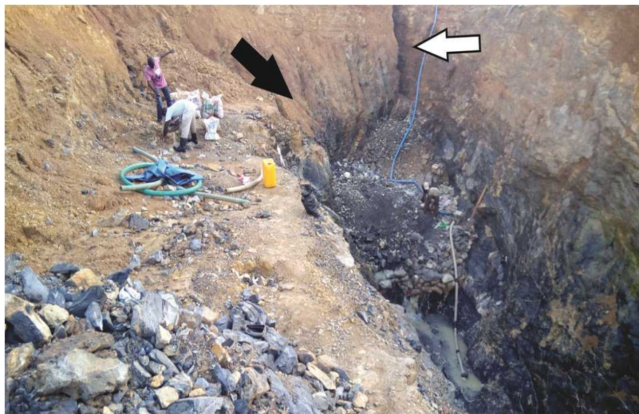
Fig 7. Typical mine in the Benue Trough with poor benching (Note: Dark arrow showing failed overburden with the lighter arrow showing cuts made by surface run-offs which pour into the mine)

Diversion techniques are employed to divert in-flows into the mine. This can be achieved by benching, channeling and grouting. Mine planning in the middle Benue is very poor with most mines having little or no bench allowance (as shown in Fig 7) which usually lead to damage from surface run-offs with failed materials slipping into mine pits. Therefore it is important that the mines are planned and designed optimally for dry working conditions as this ensures longevity of equity and better man hours per day. The use of well-planned benches with collation trenches will not only improve working conditions and slope stability but when applied with hydrological challenges in mind can serve as a tool for handling surface and formation waters.